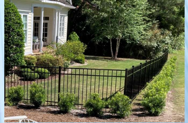
golf course screening at install