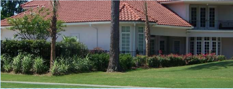
mature golf course screening