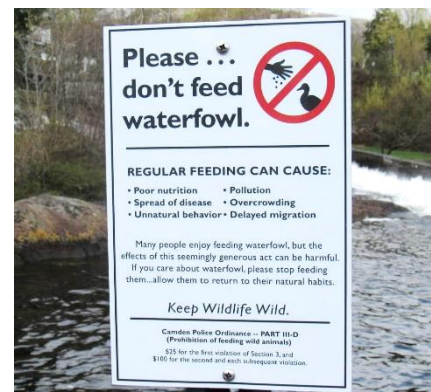
Ordinances against feeding ducks and geese can help prevent overpopulation issues.