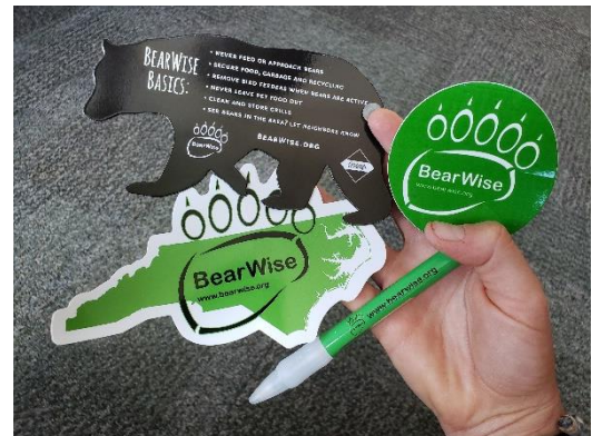
BearWise provides printable handouts and other items for community residents that teach how to live responsibly with bears.