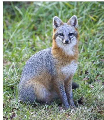
Gray foxes are common in residential areas across North Carolina.