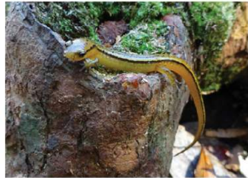
Two-lined salamander, Eurycea cirrigera

animal's oasis, where they hide and forage among leaves and logs in and around streams and seepages. Tiny insects, mites, and worms are preferred prey. In turn, these amphibians are food for birds, small mammals, and some snakes. Though small in size, as predator and prey, salamanders move a lot of energy through the ecosystem.