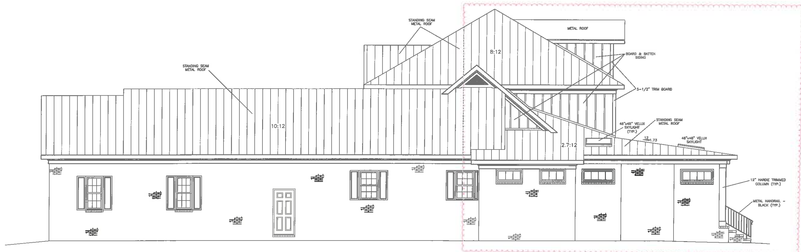
RIGHT ELEVATION 1/4" = 1'-0"