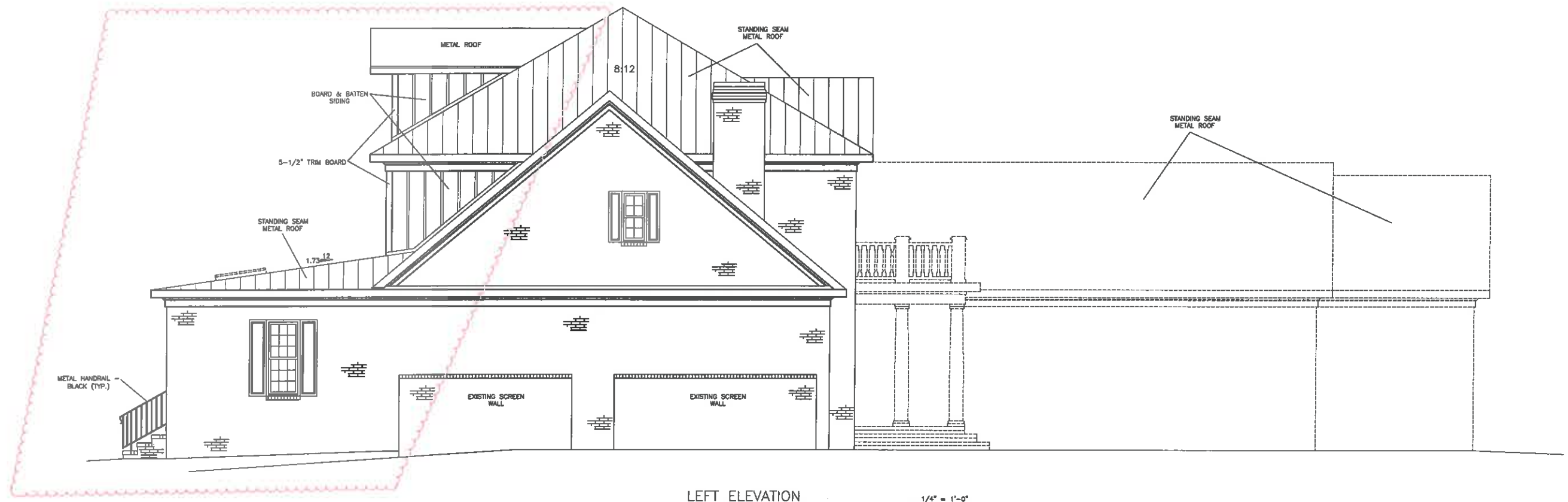
LEFT ELEVATION 1/4" = 1'-0"